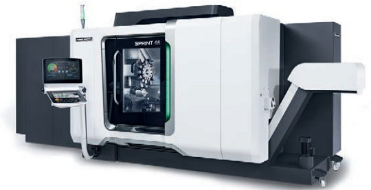
n.2 - SPRINT 65 GILDEMEISTER