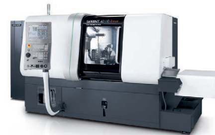
n.3 - SPRINT 42 LINEAR GILDEMEISTER