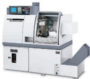
n.5 - GD 20 GILDEMEISTER