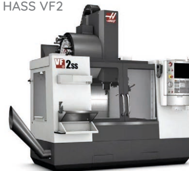
D - HASS VF2