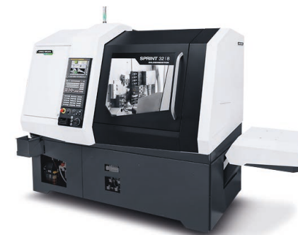
C - SPRINT 32/8