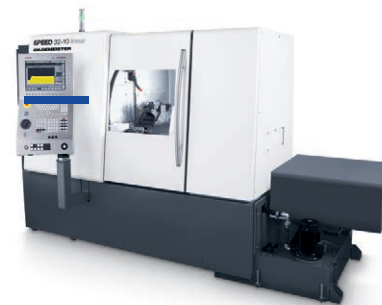
n.2 - SPRINT 32 GILDEMEISTER