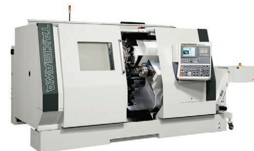
n.2 - TAKISAWA TMA 250