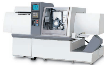
n.3 - GD32 GILDEMEISTER