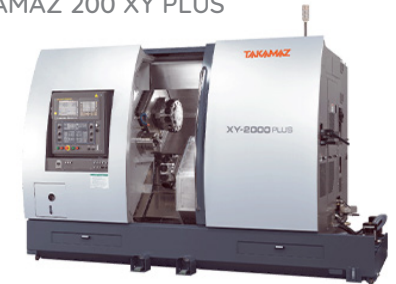
B - TAKAMAZ 200 XY PLUS